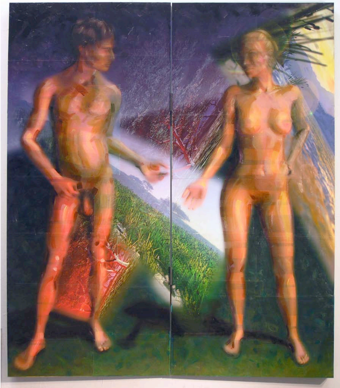
Couple 3 Diptych, acrylic and digital prints on wood panels, 75" x 66" 2007- 2008