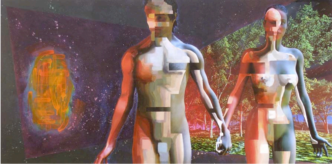
Couple 2 , acrylic, oil and digital prints on wood panel, 34" x 69"